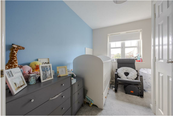
Bedroom two 9'3" x 9'2" (2.82 x 2.80)